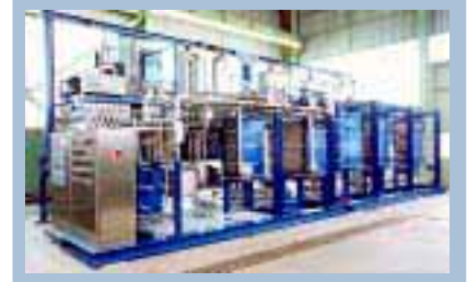
SigmaStar® Evaporator Systems

Utilizing the SigmaStar® plate, this evaporator system is designed to remove water or other solvents, while concentrating solutions. SigmaStar® Systems can be pre-assembled and pre-tested prior to shipment for quick and easy start up.