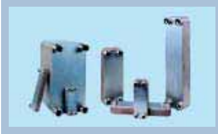
Brazed Plate Heat Exchangers

Off-the-shelf, standard units reflect the latest in plate heat exchanger technology for maximum performance and low cost. Ideal for OEM or aftermarket applications. Many models stocked and ready to ship. Models for process or refrigeration applications.