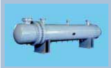
TEMA Shell and Tube

A wide variety of TEMA types are available using pre-engineered or custom designs in various sizes and materials. Shell diameters from 6" (15.24 cm) to 60" (152.4 cm), ASME, TEMA, API, ABS, TUV, PED and other code constructions available.