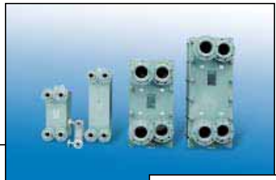
all stainless steel units