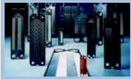
Gasketed Plate Heat Exchangers

The Schmidt-Bretten line of gasketed plate & frame heat exchangers provide excellent heat transfer in a compact space. Plates are pressed from stainless steel, titanium and other alloys. Gaskets of nitrile, EPDM, Viton®, compressed fiber and Teflon® are used. Capacities range from 0.5 to 10,000 GPM.