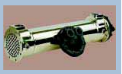
Hubbed Shell and Tube Heat Exchangers

Straight or U-tube, fixed or removable tubesheet general purpose exchangers designed to cool oil, water, compressed air and other industrial fluids. A variety of port configurations and materials are available. Diameters from 3" (7.62 cm) to 12" (30.48 cm).