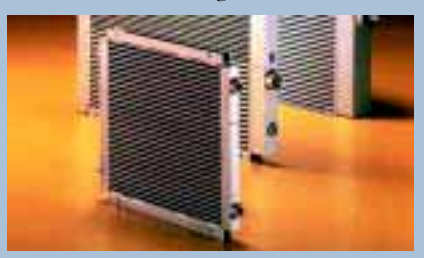
Air-Cooled Heat Exchangers

High efficiency, brazed aluminum coolers for cooling a wide variety of liquids and gases with ambient air. Lightweight, yet rugged. Capable of cooling multiple fluids in single unit. Models can be supplied with cooling fan and a variety of drives.