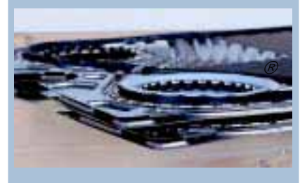
Semi-Welded Plate Heat Exchangers

Combines the high thermal efficiency, compact design, and low volumetric liquid hold-up of a plate heat exchanger with the leak prevention of a shell & tube. Ideal for ammonia applications.