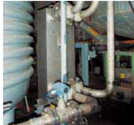
SIGMAWIG ST 40 tempering of chemical reactor

excellent for condensation of refrigerants, high pressure heating, or other applications requiring higher operating pressures