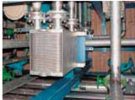
SIGMAWIG ST 12 tempering of chemical reactor thermoil/ ethylenglycol