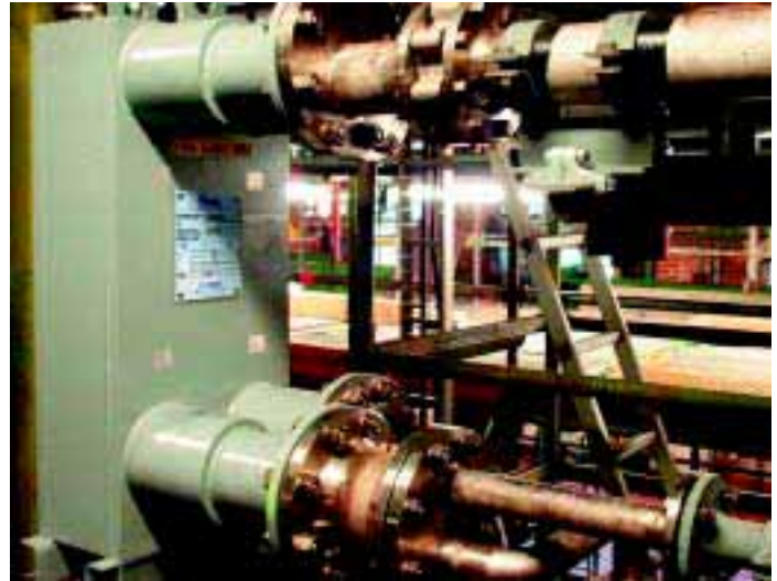
SIGMAWIG ST 30 for steam condensation

The Sigmawig all-welded plate heat exchanger consists of the required number of corrugated thermal plates arranged in alternating passages for counter-current flow, similar to gasketed plate heat exchangers. However, unlike the traditional plate & frame design which uses elastomer gaskets on the perimeter of each plate to create the seal, the plates of the Sigmawig units are sealed together hermetically by TIG welding the seams without filler. This greatly increases the maximum operating temperature and pressure.