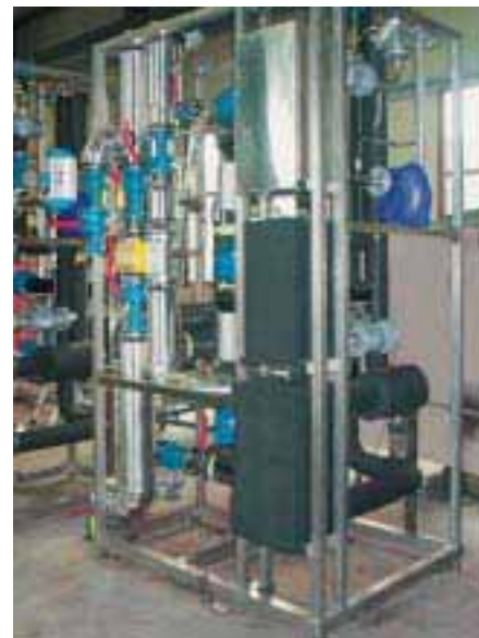
Compact reactor heating-cooling module