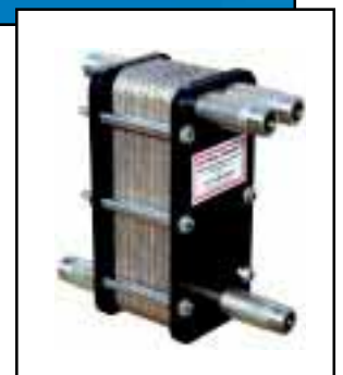
carbon steel frame