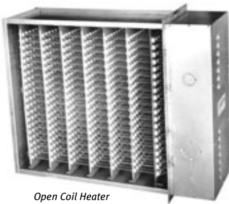
Open Coil Heater

TIP 6. PRESSURE DROP. The less space occupied in the heater by elements, the lower the pressure drop. Therefore, heaters with open coil elements have the lowest pressure drop. Finned tubular elements will have a higher pressure drop than open coil, but tubular elements have the highest pressure drop due to the higher percentage of space occupied in the heater.